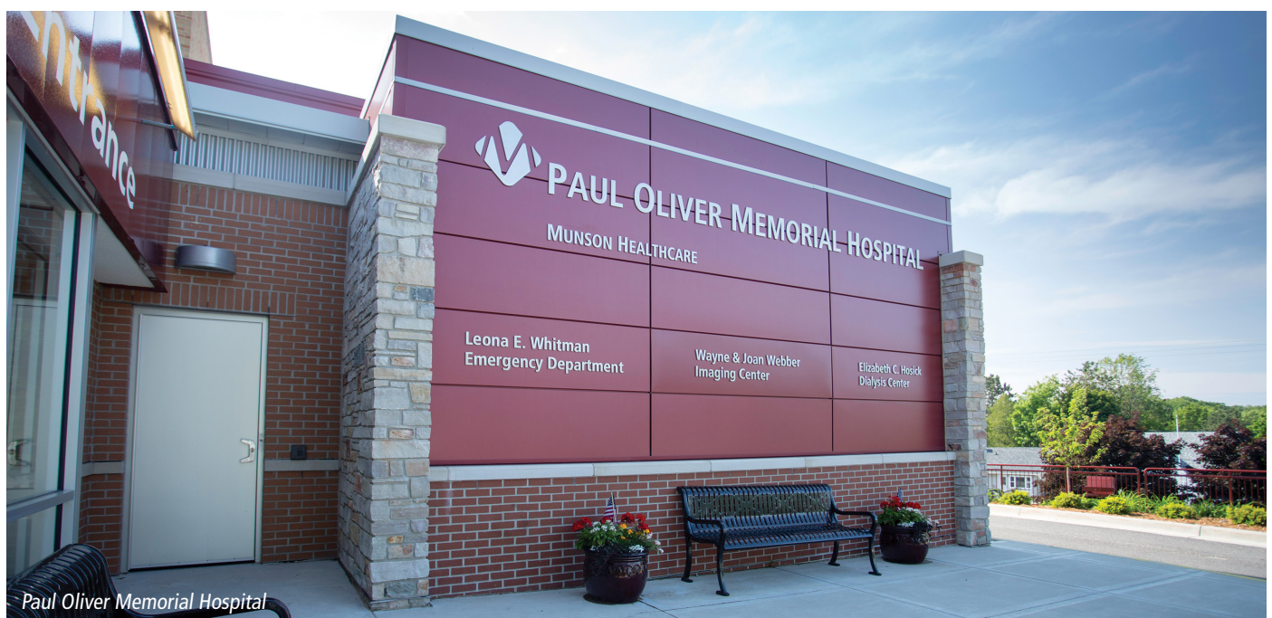
Paul Oliver Memorial Hospital

POMH enjoys strong community support that has allowed it to obtain advanced technology not often found in hospitals of its size, including an 80-slice CT scanner and digital mammography. Frankfort is a small, scenic community on the Lake Michigan shoreline, nestled between Sleeping Bear Dunes National Lakeshore and the Elberta Bluffs. Its natural harbor makes it a favorite stop of boating enthusiasts. It also is home to a thriving arts community. POMH serves all communities in Benzie County, including Benzonia, Beulah, Honor, Lake Ann, and Thompsonville. Benzie County is the smallest of Michigan's 83 counties.